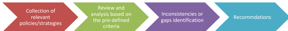
FIGURE 1 PROCESS FLOW

The study followed qualitative research and It was mainly based on secondary research. As the objective of the study was to analyze several policies/strategies relating to NSSS of Bangladesh, the initial stage of the study was to collect of policies that are associated with Bangladesh’s NSSS. The policies were updated so that the latest versions were reviewed. The policies/strategies were basically collected in soft copy version. In total, 30 policy/strategy papers were collected for review and analyzed based on the pre-defined criteria. The criteria were selected considering the objectives of the study. The policy papers were then reviewed in order to explore whether the policies have addressed anything regarding people with low income level, women, marginal groups (ethnic groups), vulnerable groups (old aged people, children, pregnant women) etc. It is compilation of national policies to check or assess whether those policies have any component on poverty, vulnerability, marginal groups, life cycle risks etc. After the inconsistencies or gaps were identified for each strategy paper. For this study, the sampling of the study was purposive or subjective Sampling. As conducting a policy analysis ensures the researchers have gone through a systematic process to choose the policy option that may be best for that situation. This study followed a systematic process to analyze the policies/strategies regarding the NSSS. The following diagram showed the process of the study: