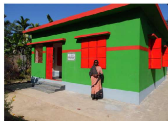
বীরমুক্তিযোদ্ধা সূক্ত শহীদগণের পরিবারের জন্য নির্মিত বাসস্থান কলকাতা, মৌলভীবাজার