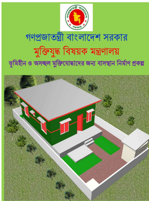
ভূমিহীন ও অসচ্ছল মুক্তিযোদ্ধাদের জন্য বাসস্থান নির্মাণ প্রকল্পের মডেল