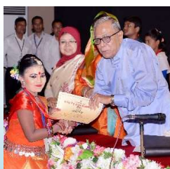
রাষ্ট্রপতি মোঃ আবদুল হামিদ ১৮ মে ২০১৭ খৃস্টাব্দের ঢাকার পিতা একাডেমি মিলানরতনে রাষ্ট্রীয় পিতা পুরস্কার প্রদানক্রমে ২০১৭ এর ক্ষিপ্রা পিতা পুরস্কার বিজয়ী হতে -পিতা