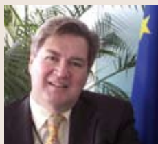
Koos Richelle Director-General

One in five people today suffer from hunger and malnutrition, the effects of which on the physical and mental growth of those affected can be irreversible in some cases. Not only is hunger morally unacceptable, but it also acts as a brake on economic and human development in the poorest countries.