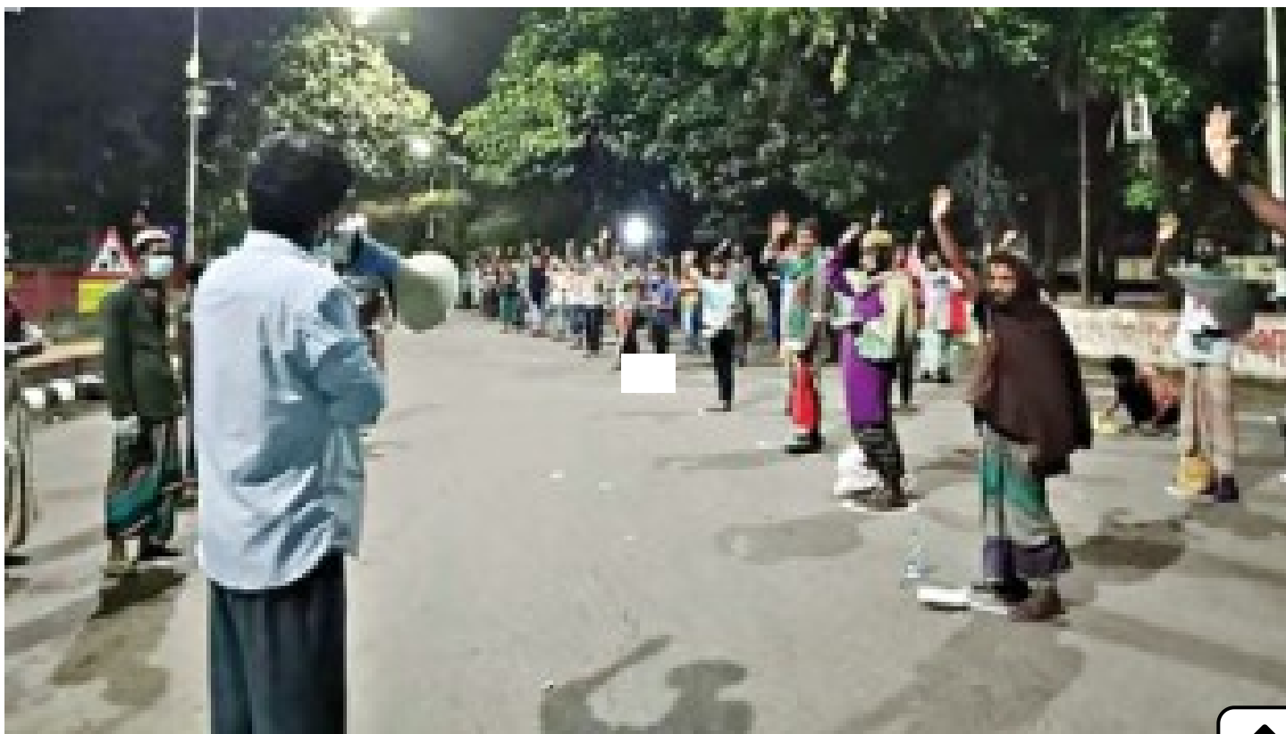
(Watch) Students serving free sehri, iftar