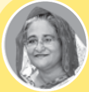
Sheikh Hasina, MP

The government of Bangladesh realized only SureCash has the ability to deliver a project of such enormous scale!