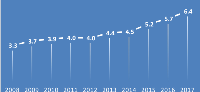
Beneficiaries in Millions