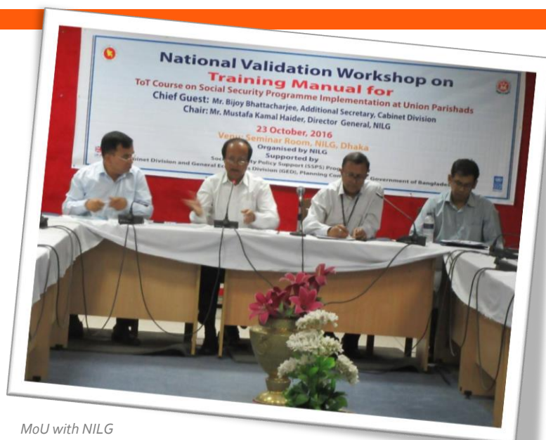
MoU with NILG

A MEMORANDUM OF UNDERSTANDING (MoU) will be signed by Social Security Policy Support (SSPS) Programme, Cabinet Division Bangladesh Secretariat, and the National Institute of Local Government (NILG), Local Government Division, Ministry of Local Government, Rural Development and Cooperative for Capacity Building Support for selected trainers of Upazila Resource Team (URT), Union Parishad (UP) Representatives and UP Secretaries. This agreement will formalize the collaborative efforts to expedite the familiarization of the NSSS to all the stakeholders such as UPs representatives,