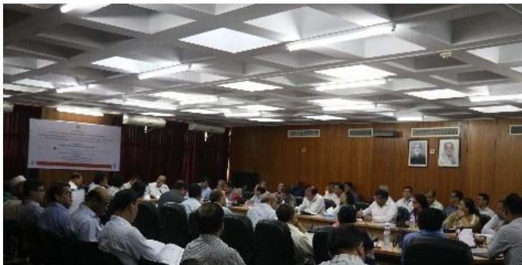
SOCIAL SECURITY POLICY SUPPORT (SSPS) PROGRAMME