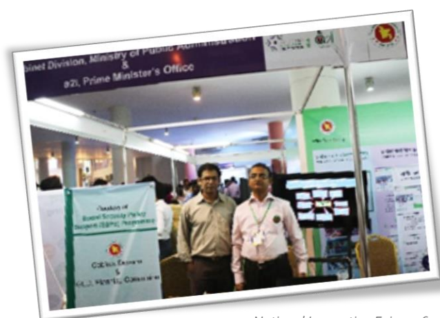
National Innovation Fair 2016

Upazila officials (URT members), and will develop the capacity of implementation and management of SSPs both at central and field levels. SSPS will ensure the conduct of capacity building for selected trainers of Upazila Resource Team (URT), Union Parishad (UP) Representatives and UP-Secretaries from pilot districts.